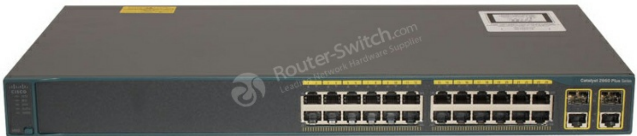
Table 1 shows the Quick Specs.

Figure 1 shows the appearance of the WS-C2960+24TC-L.