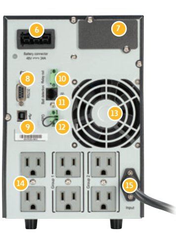
Model 9SX1500 shown here