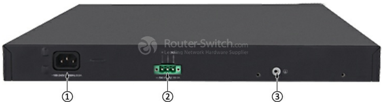
Figure 3 shows the back panel of HPE JG962A.